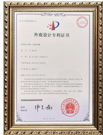
Патентный номер: 20163065523,4