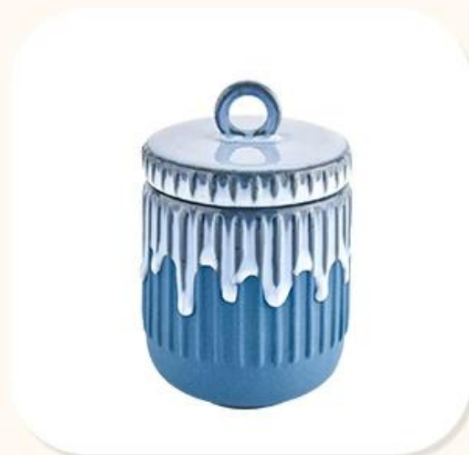
Ceramic Candle jar