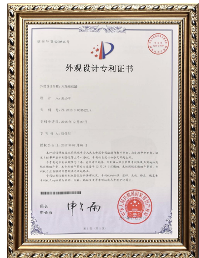
Номер патента: 201630655323.4.