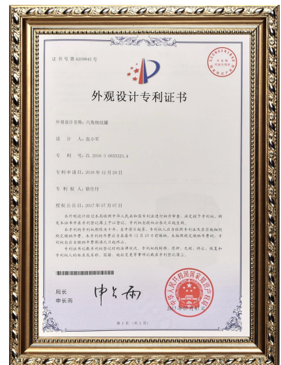
Número da patente: 201630655323.4