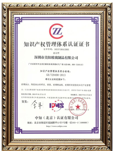
Propriedade intelectual corporativa