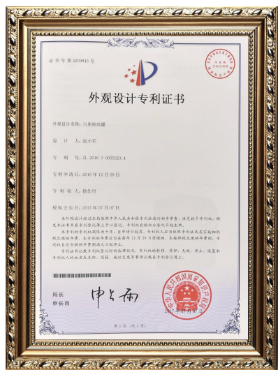
Patente no.: 20163065523.4