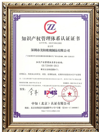
Propriedades intelectuais da empresa