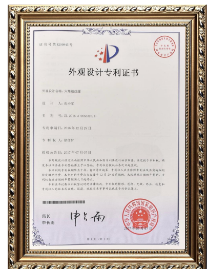
Número da patente: 201630655323.4