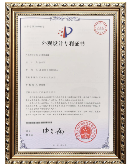
Número da patente: 201630655323.4