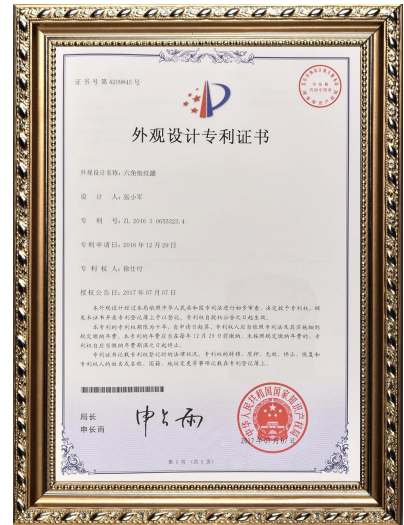
Patent Number: 201630655323.4