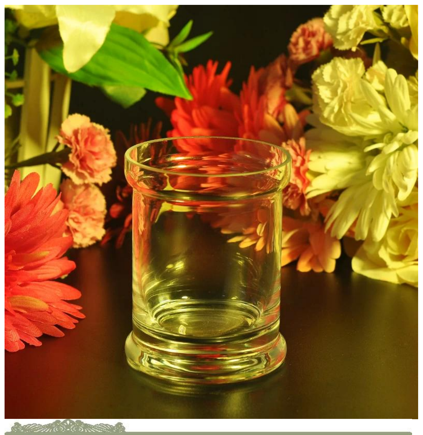
Similar Products Link