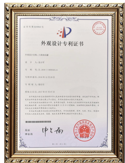
Patent no.: 20163065323.4