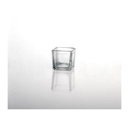
square clear glass candle holder