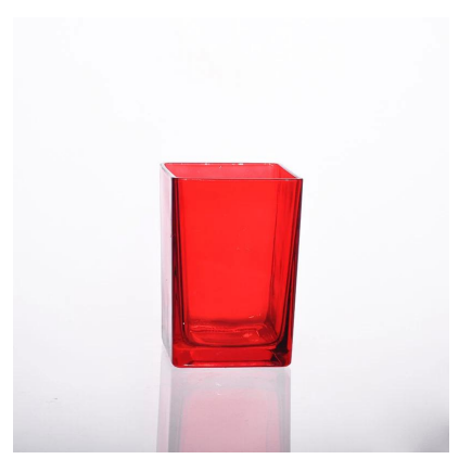
spray color glass candle holder