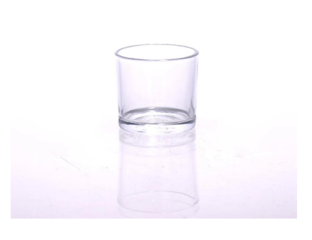
machine made glass candle holder