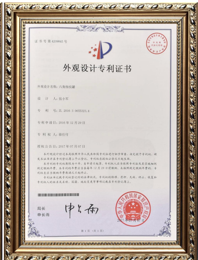
ISO 9001: 2015 Corporate intellectual property Patent no.: 201630655323.4