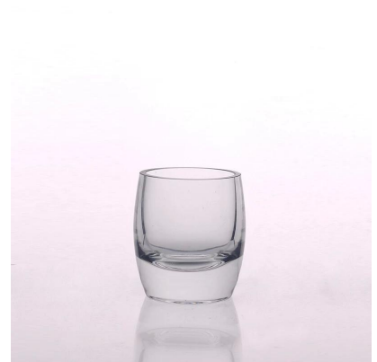
heavy bottom glass