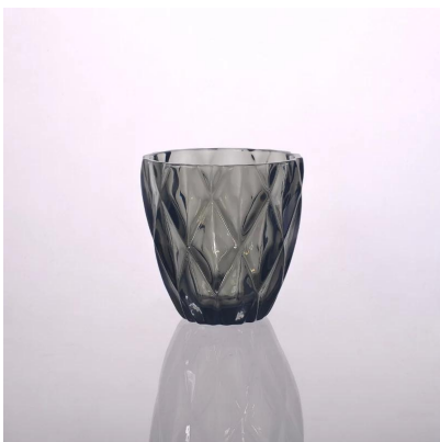
votive glass candle jar