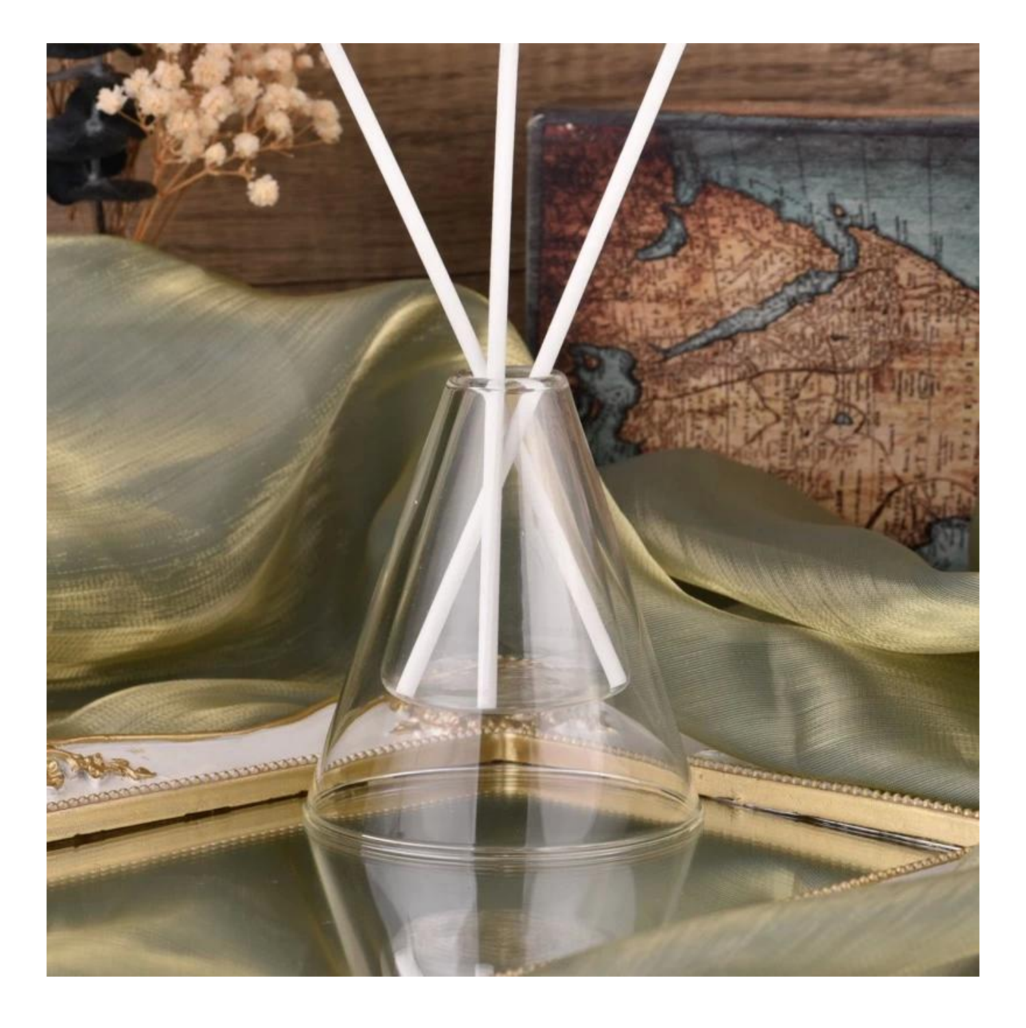
Wide range of application