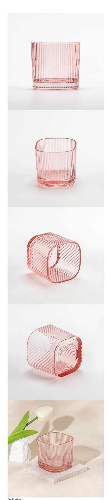
Decorative dinner in the bar or bar . Suitable for families, hotels or gardens . Special lover gift . Any chance of decoration