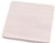
White pine wood lid