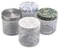
Metal with printing