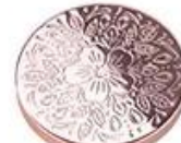
Zinc alloy embossed