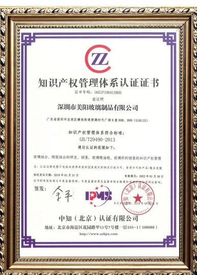
Corporate intellectual property