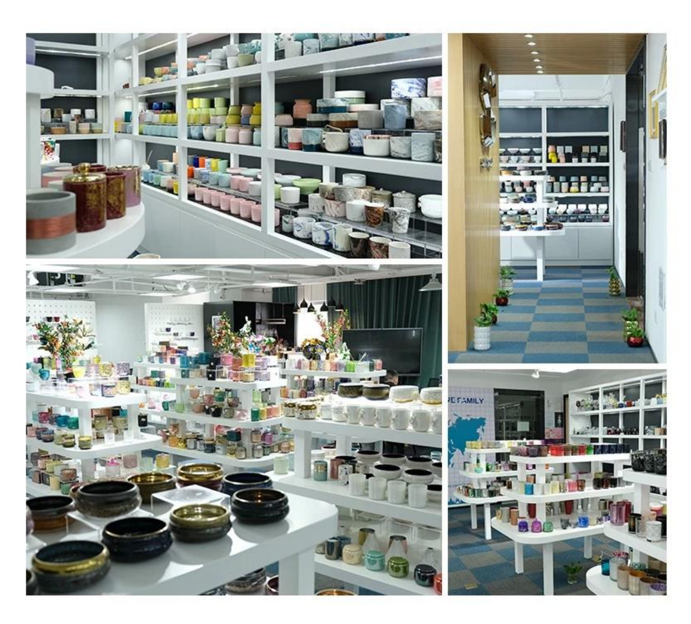
Here we bring together a total of 5000+ kinds of candle holder carefully designed and made, each candle holder reflects our persistent pursuit of quality and design.