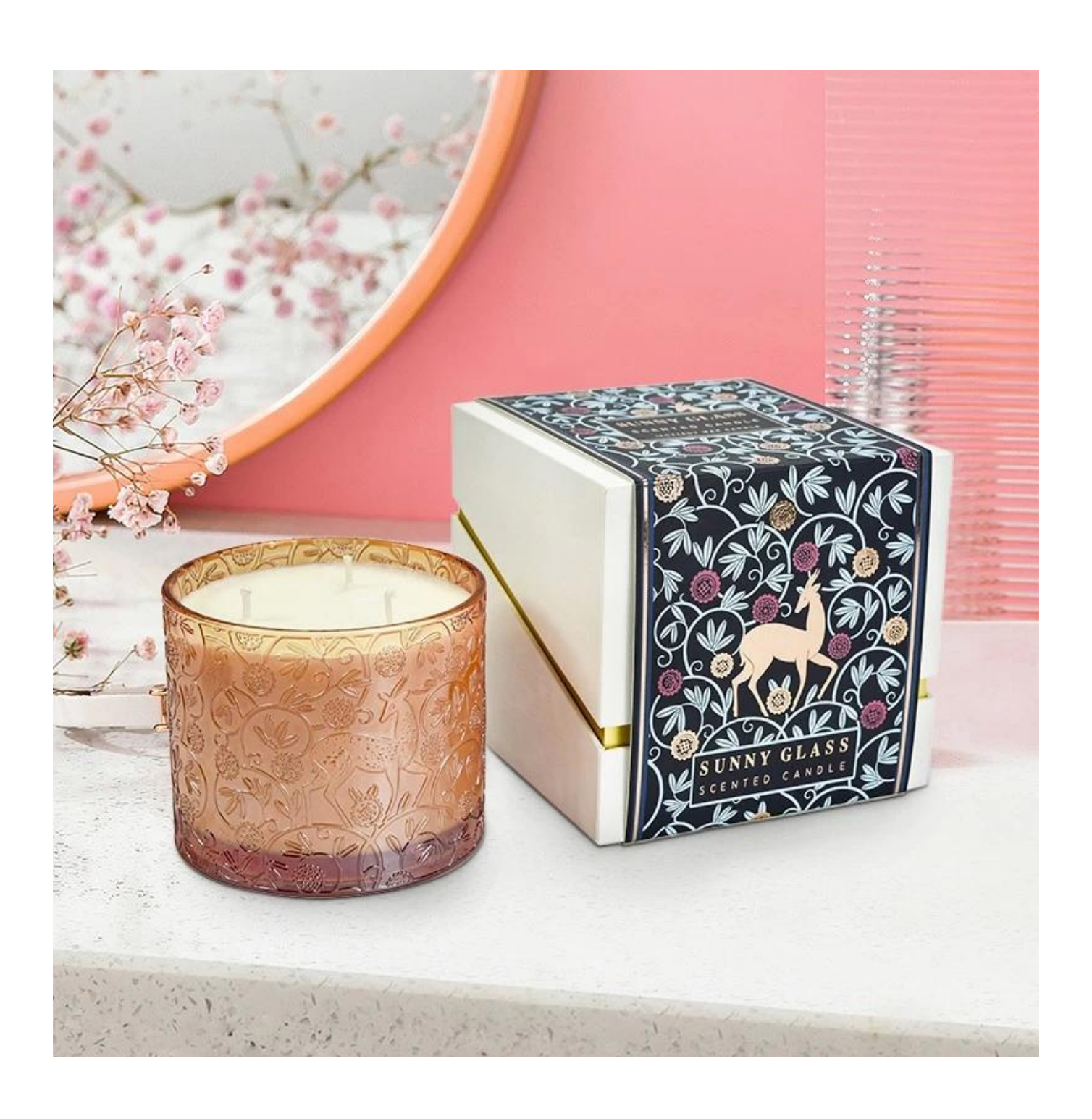
Why Choose Sunny Glassware