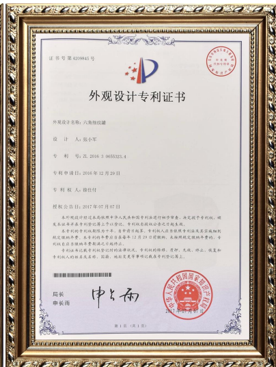
ISO 9001: 2015 Corporate intellectual property Patent no.: 201630655323.4