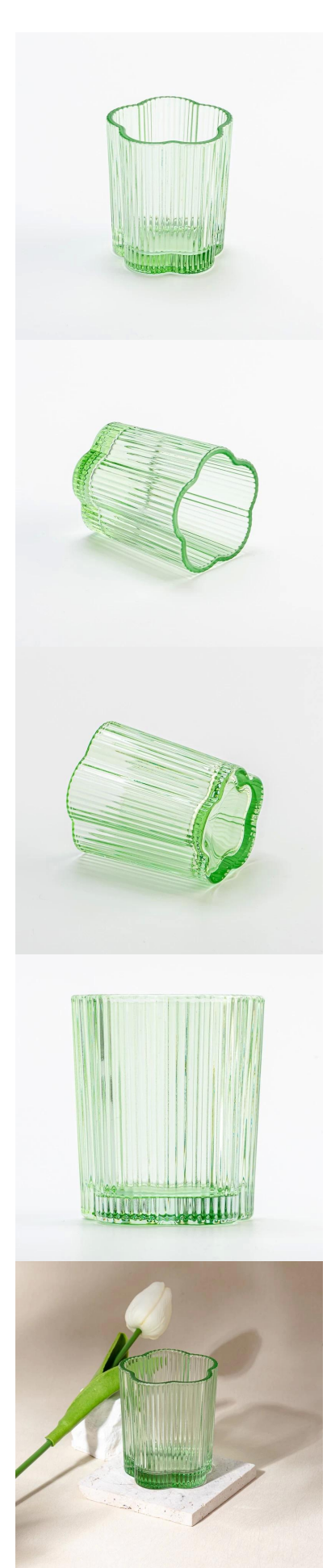
Application: Decorative dinner in the bar or bar . Suitable for families, hotels or gardens . Special lover gift . Any chance of decoration