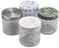
Metal with printing