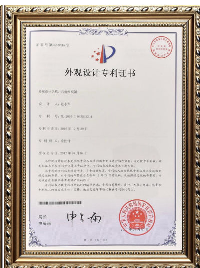
ISO 9001: 2015 Corporate intellectual property Patent no.: 201630655323.4