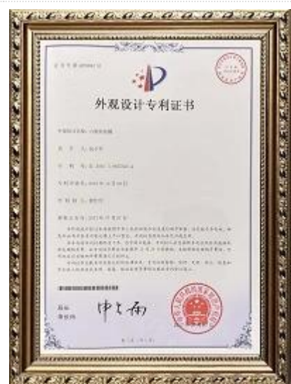
Patent no.: 201630655323.4