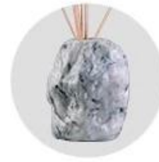
Water Transfer Printing