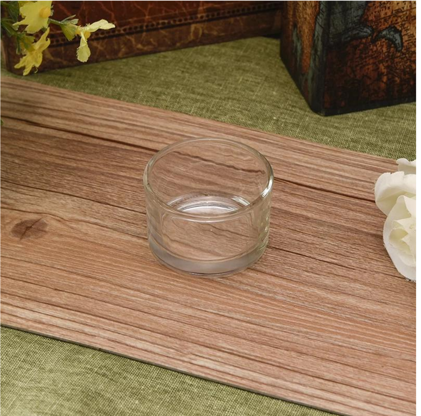
Candle lids accessories: