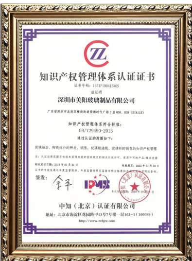
Intellectual properties of the company Patent N.: 201630655323.4