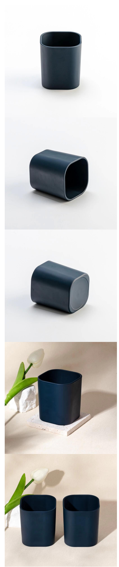
Application: Decorative dinner in the bar or bar . Suitable for families, hotels or gardens . Special lover gift . Any chance of decoration