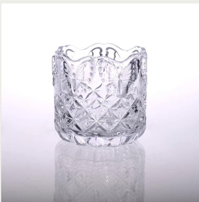
Glass candle holder with butterfly logo