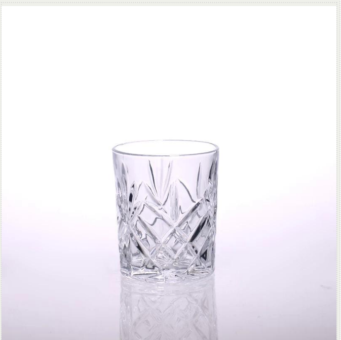
glass candle holder cup