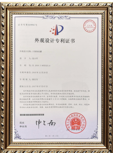
ISO 9001: 2015 Company intellectual properties Patent number: 20163065523.4