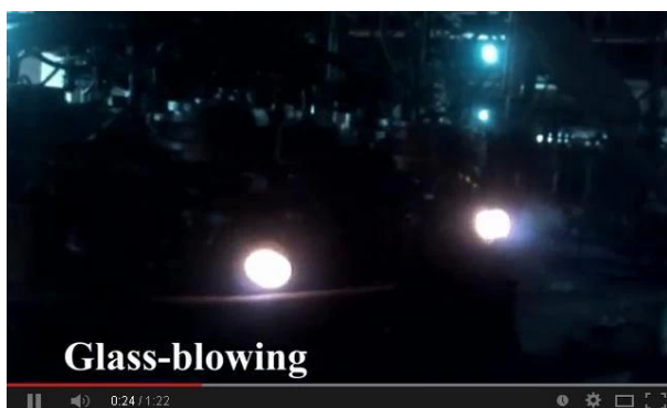
Machine blowing technology

Hereby watch our production line video online, welcome to visit us on site.