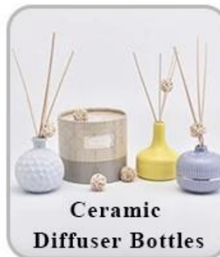
Ceramic Diffuser Bottles