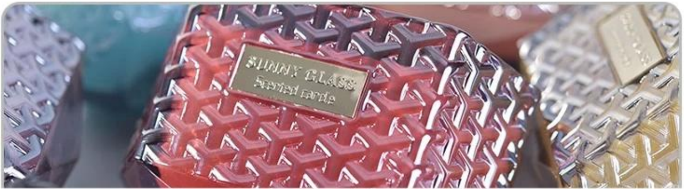
Glass Candle Holders