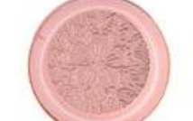
Zinc alloy embossed