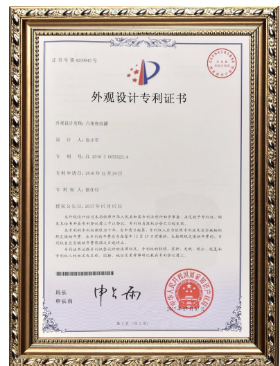
Patent number: 201630655323.4