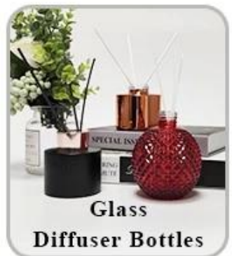
Glass Diffuser Bottles