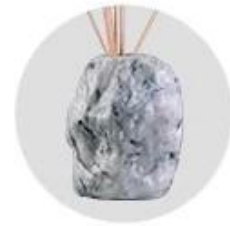
Water Transfer Printing