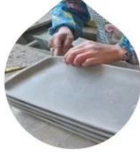
8、 Glazed Firing