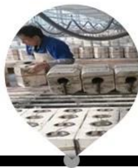
3、 Platform Casting