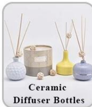
Ceramic Diffuser Bottles