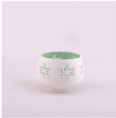
hand made ceramic candle holder