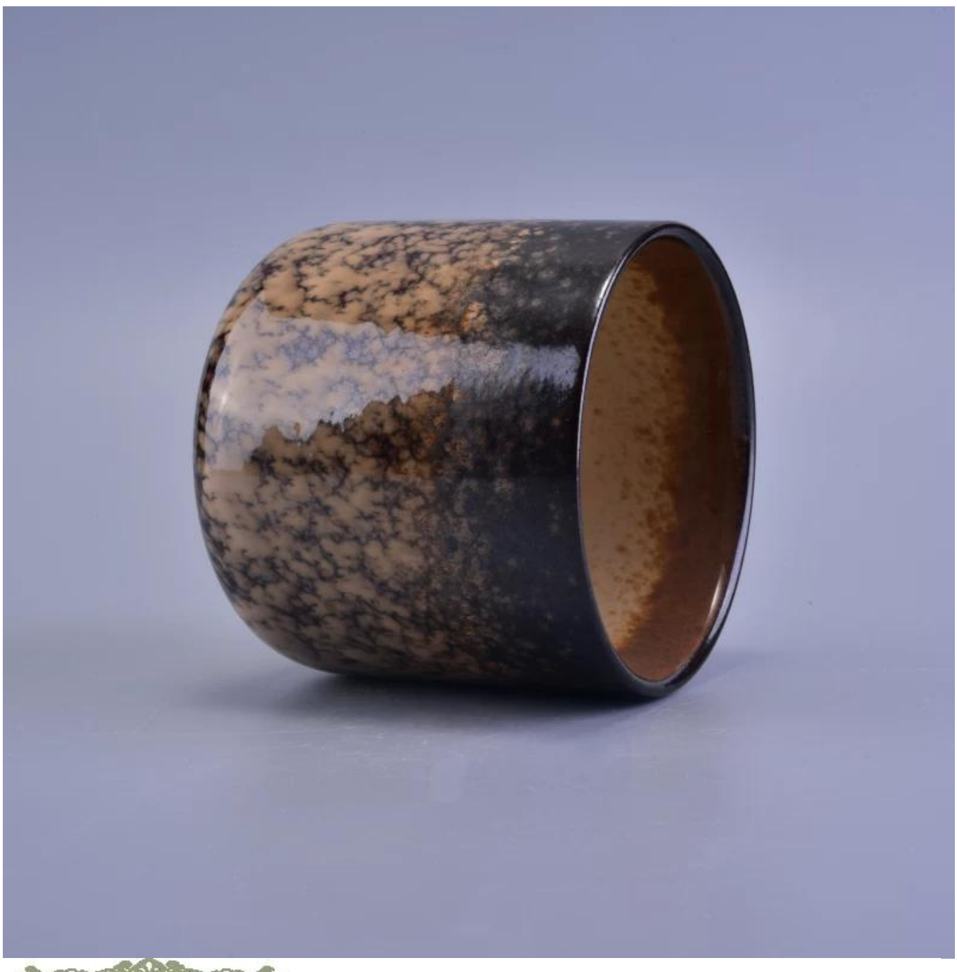
Similar Products Link