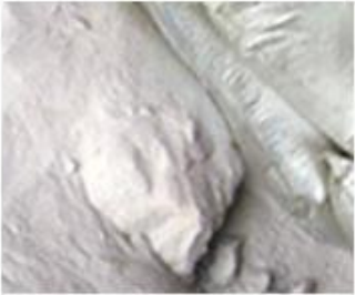
1、 Raw Material