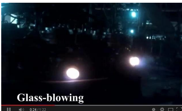
Machine Blown Technology

Hereby watch our production lines video online, and welcome to visit us onsite.