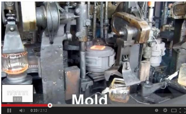
IS Machine Technology