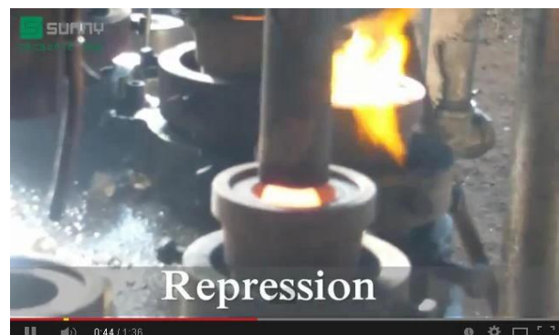
Machine Press Technology