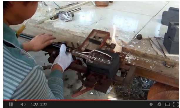
Hand Blown Technology