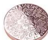
Zinc alloy embossed