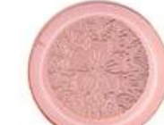
Zinc alloy embossed