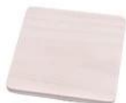
White pine wood lid