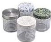
Metal with printing