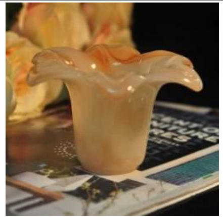
Flower shape cylinder jade amber color decorative glass candle jar candle holder