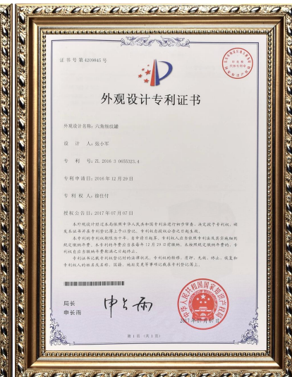
ISO 9001: 2015 Corporate intellectual property Patent no.: 201630655323.4