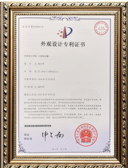
ISO 9001: 2015 Corporate intellectual property Patent no.: 20163065323.4