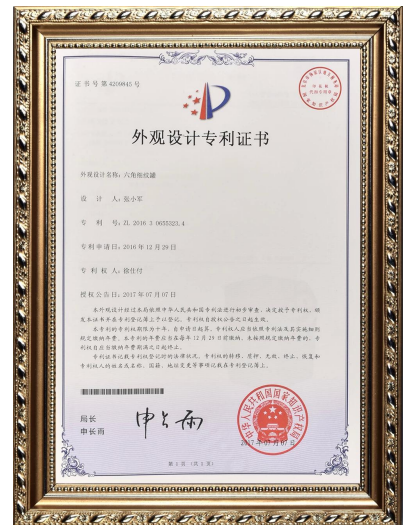
Patent Number: 20163065532.4