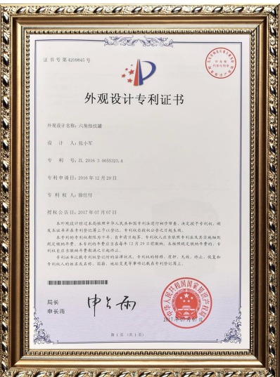
ISO 9001: 2015 Corporate intellectual property Patent no.: 20163065323.4