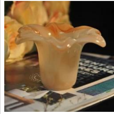
Flower shape cylinder jade amber color decorative glass candle jar candle holder