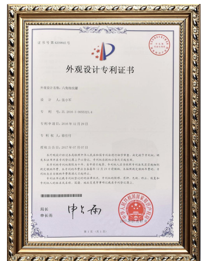
Numer patentu: 201630655323.4