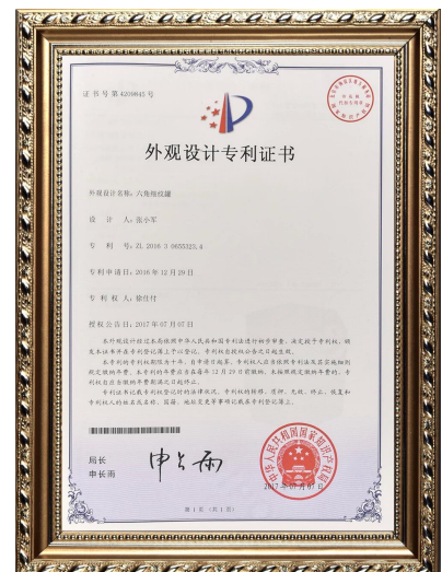
Numer patentu: 201630655323.4