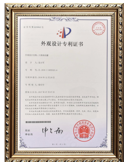
Paten no .: 201.630.655.323,4