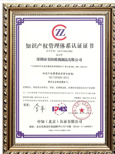
harta intelek korporat