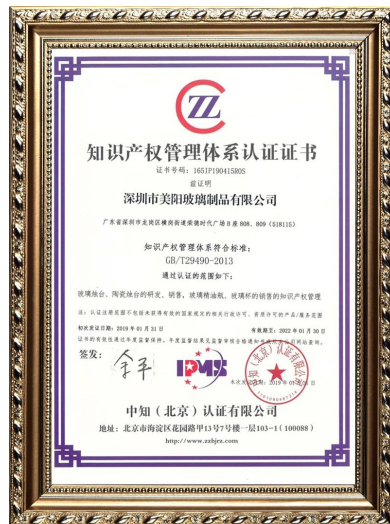
Harta intelek perusahaan