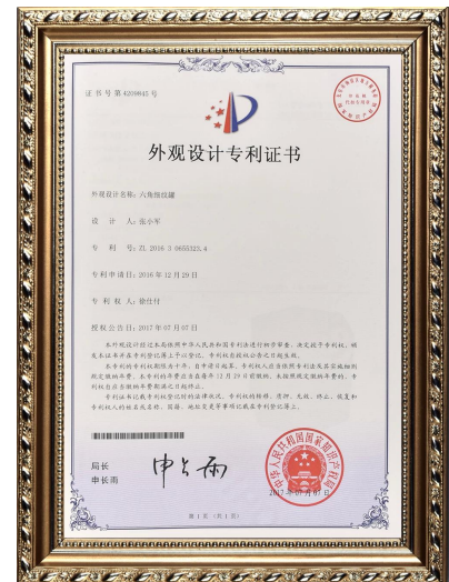
Nombor Paten: 201630655323.4